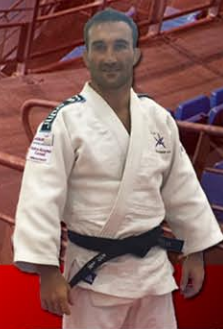
BENJAMIN DARBELET OLYMPIC VICE-CHAMPION